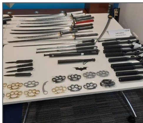
Figure 2 Knives and weapons intercepted at a mail distribution centre.